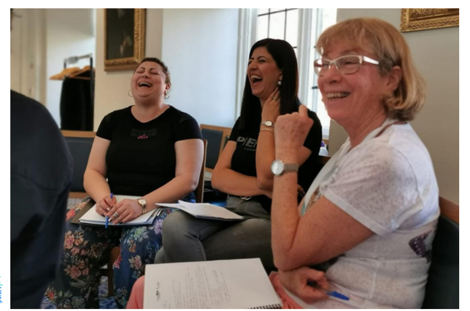
Fig 4: Teachers during a teacher training event with Solutions Not Sides

Schools should nominate one teacher to be the lead teacher on The Olive Branch Award, but multiple teachers are welcome to run the programmes and attend events.