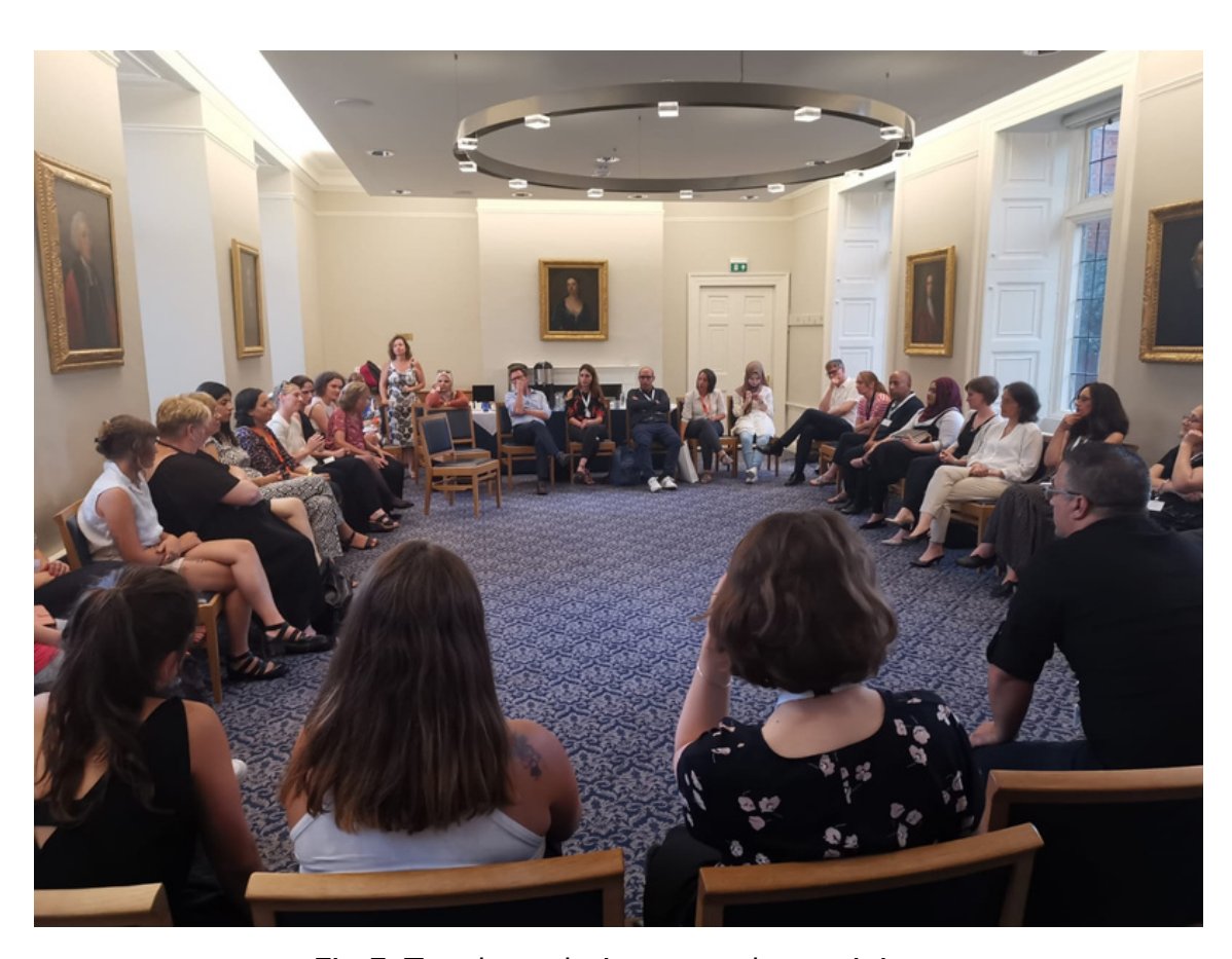
Fig 5: Teachers during a teacher training event with Solutions Not Sides